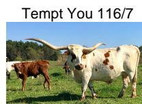
Tempt You 116/7