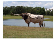
COWBOY TUFF CHEX