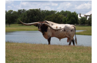
COWBOY TUFF CHEX